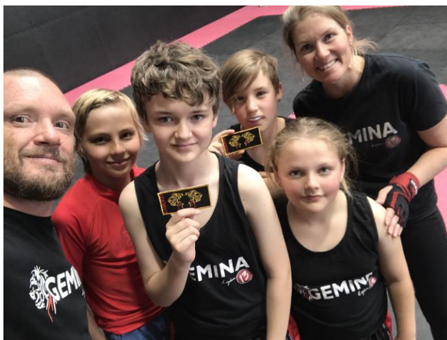
Samurai's – Yellow (Grade 2)