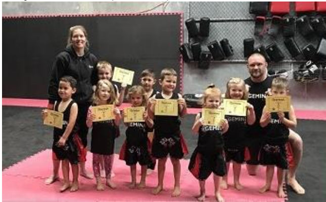
Ninja's – Yellow (Grade 2)