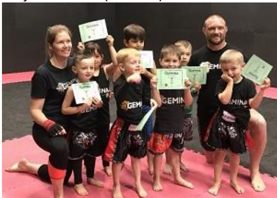
Ninja's – Green (Grade 3)