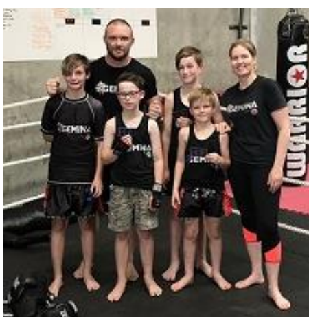
Samurai's – Blue & Purple (Grade 4 & 5)