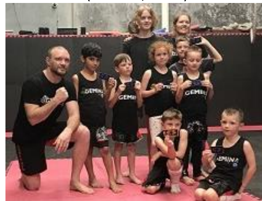
Commando's – Blue, Purple & Orange (Grade 4, 5 & 6)