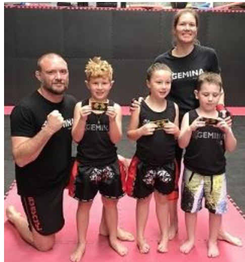
Commando's – Yellow (Grade 2)