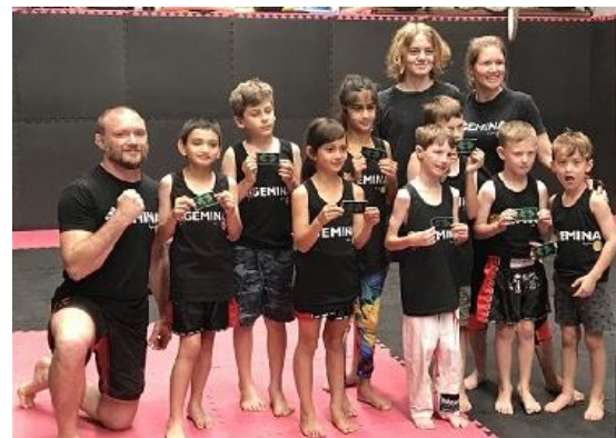
Commando's – Green (Grade 3)