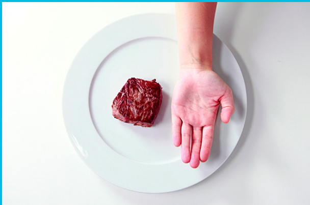
1 palm of protein dense foods with each meal