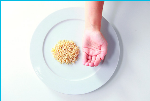
1 cupped handful of carb dense foods with most meals