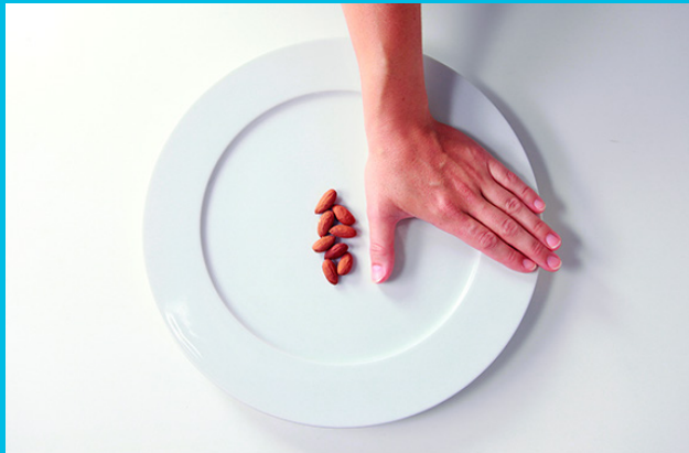
1 entire thumb of fat dense foods with most meals

Note: Your hand size is related to your body size, making it an excellent portable and personalized way to measure and track food intake.