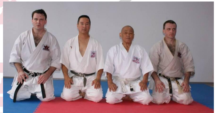
Soke in Poland