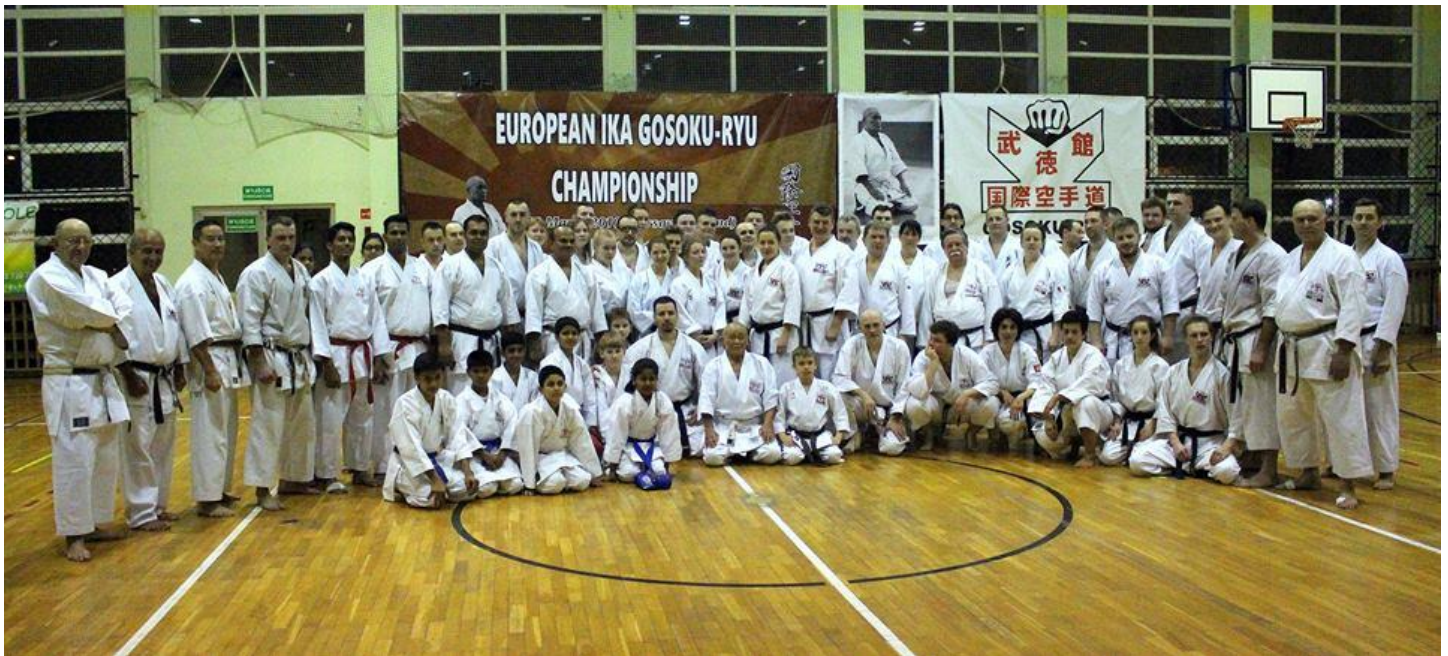
European IKA Gosoku Ryu Championship – Warsaw, Poland