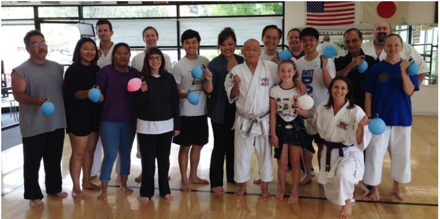
Kubotan Class IKA Headquarters, May 2016

The defensive mindset manifests itself in the physical way the martial artist carries himself. The would be predator on the street can feel the aura that surrounds a person with the defensive mindset and immediately can tell that this person is not going to be easy prey and instead the predator will go elsewhere and seek easier quarry. Not unlike wild animals, street predators will seek the weak, the inattentive, the old and feeble to make their targets. They are lazy and cowards and they are looking for the easiest way to get what they want whether it be money, or the feeling of domination and power.